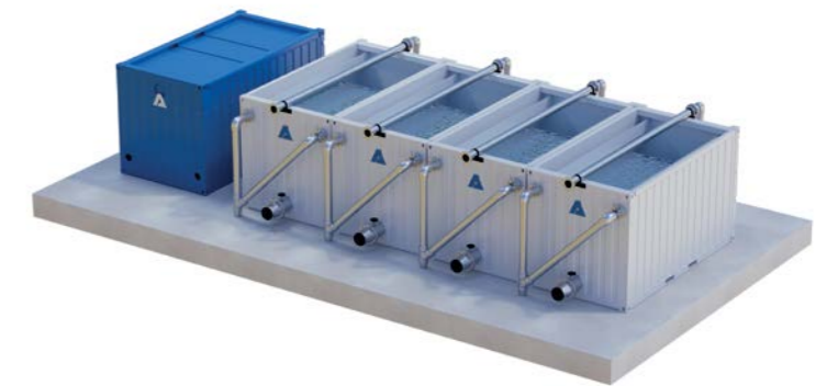
Process control container with multiple filtration containers

During maintenance works at a full scale water filtration plant the AMFU helps keeping your process up and running and avoiding costly downtimes.